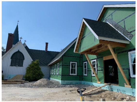
Don't miss it: more photos get added more frequently on our Facebook page